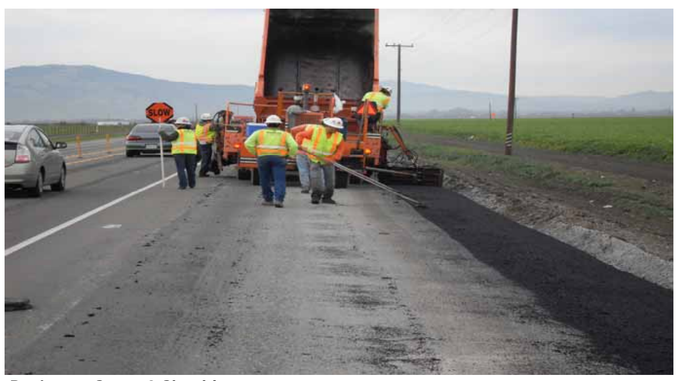
Paving on Stage 2 Shoulder