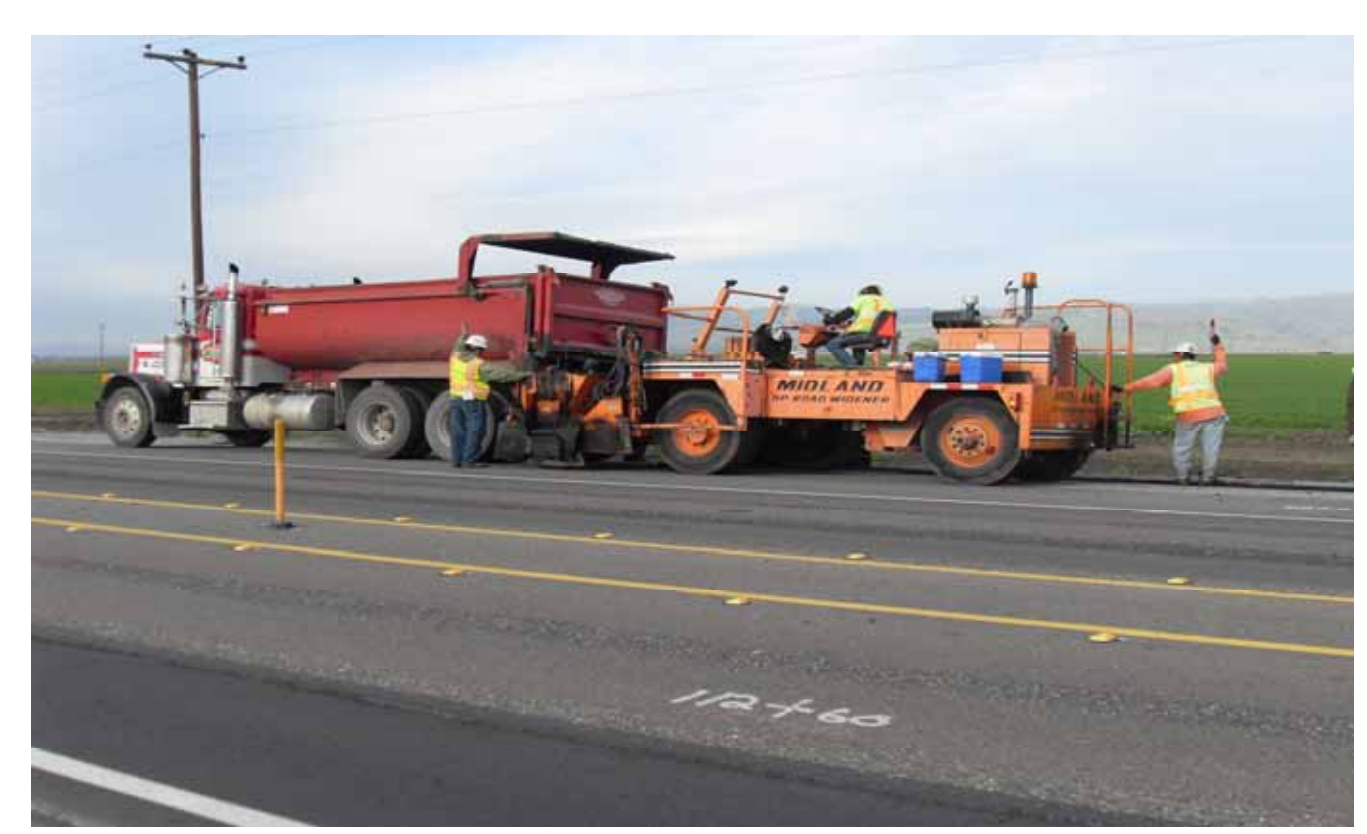
Pavex Paving Stage 2 Traveled Way