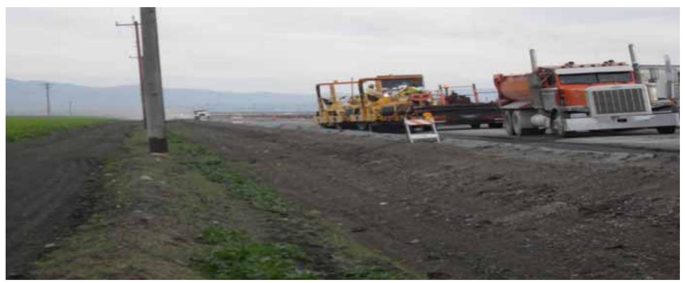
Paving on Stage 2 Shoulder